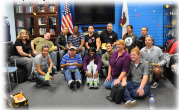
Student veterans enjoying Thanksgiving