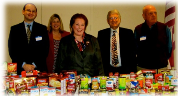
Donated food for Thanksgiving baskets provided by Daughters of the American Revolution